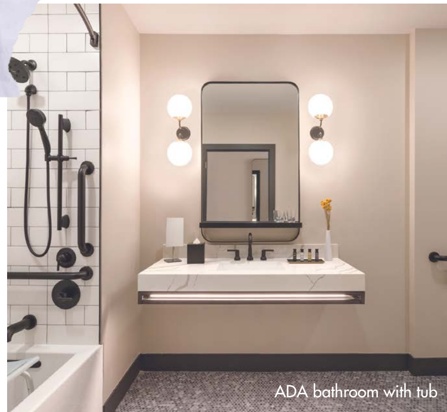
ADA bathroom with tub