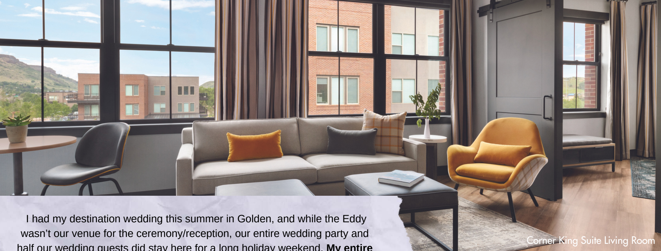
Corner King Suite Living Room